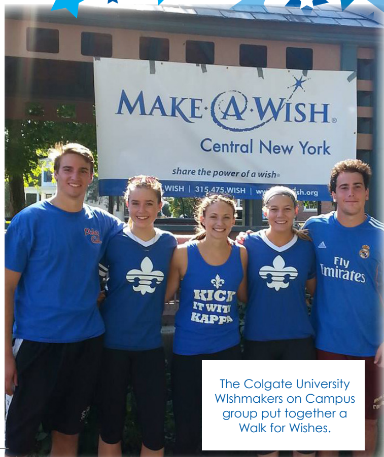
The Colgate University Wishmakers on Campus group put together a Walk for Wishes.

Make-A-Wish® Central New York 5005 Campuswood Drive East Syracuse, NY 13057