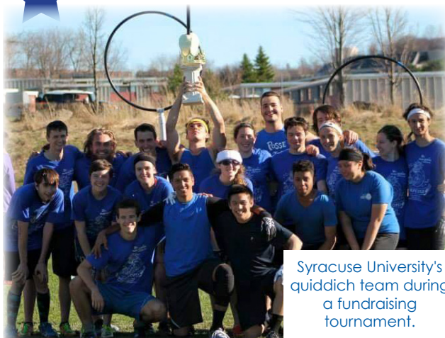
Syracuse University's quidditch team during a fundraising tournament.

Fundraising possibilities are as limitless as your imagination!